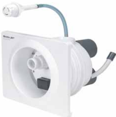
Single Nozzle CLASSIC