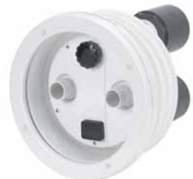
Optional original round style double ring cover available for curved pool walls.

Consult your physician before attempting any strenuous exercise. This product may not be challenging or satisfying for all levels of exercise.